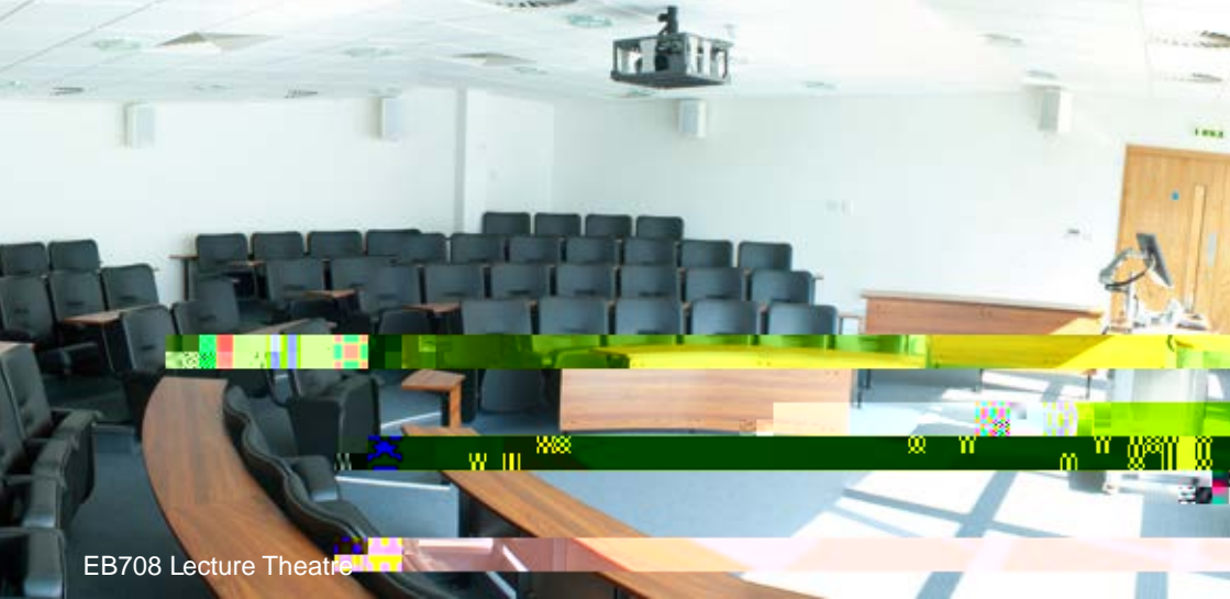
EB708 Lecture Theatre